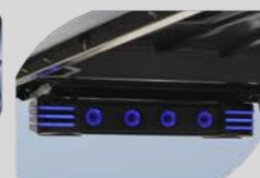
Cuboid Evolution Sound Bar