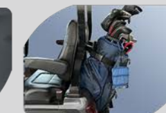
Optional Golf Bag Holder