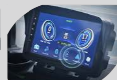
9" Touchscreen with Carplay Compatibility