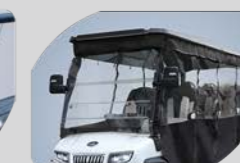
Optional All-Weather Enclosure