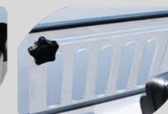
Slideable Air Vents