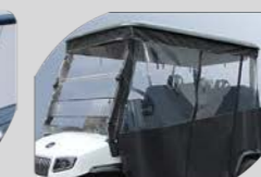
Optional All-Weather Enclosure