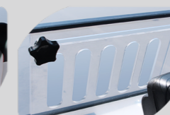
Slideable Air Vents