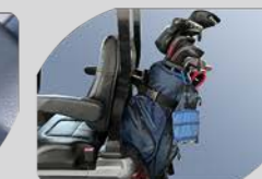
Optional Golf Bag Holder