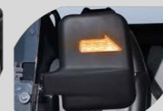
Powered Rear View Mirrors