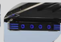
Cuboid Evolution Sound Bar