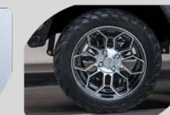
Silent Tire with Off-road Thread