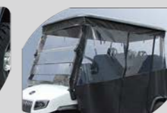
Optional All-Weather Enclosure