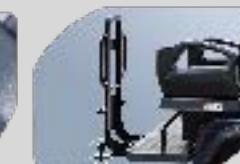
Rear Handrail with Optional Towing Hitch Receiver