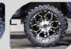
Silent Tire with Off-road Thread