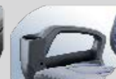
Rear Armrest With Built-in Storage Compartment