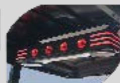
Cuboid Evolution Sound Bar