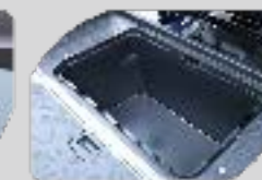
Rear Storage Compartment