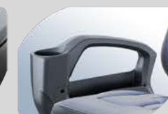
Rear Armrest With Built-in Storage Compartment