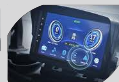
9" Touchscreen with Carplay Compatibility