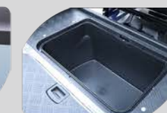
Rear Storage Compartment