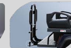
Rear Handrail with Optional Towing Hitch Receiver