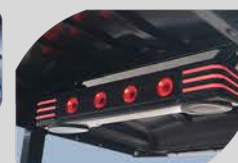
Cuboid Evolution Sound Bar