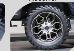
Silent Tire with Off-road Thread